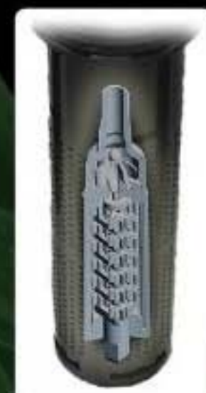
Planetary Gear Drive

Toro Irrigation Solutions—Precise. Efficient. Practical. For more information, see your Toro Spec. Manager, call 877-345-TORO, or visit www.toro.com