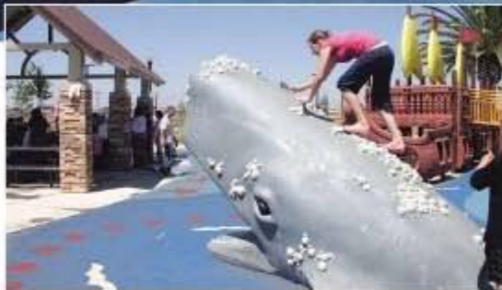
Top + inset: A 26-foot long sperm whale encrusted with barnacles breaches from the depths of the rubberized playground surfacing. The themed sculptures are precast concrete (Universal Precast Concrete).

Below: This larger-than-life Treasure Island storybook is open to the beginning of Robert Louis Stevenson's story, wherein Jim Hawkins is requested to write about his adventures and begins by recalling when the "brown old seaman with the saber cut" took up his lodgings and broke out in song with the memorable refrain: